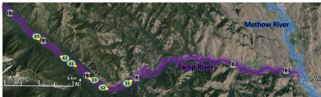
Twisp River reach and site map showing all temperature logger site locations.